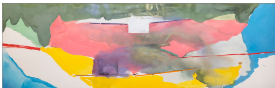
Helen Frankenthaler Off-White Square 1973 Acrylic on canvas 79 3/4" X 255 1/2" From the Louis-Dreyfus Family Collection, courtesy of The William Louis-Dreyfus Foundation Inc.