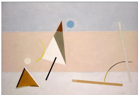
Eduard Schteinberg Composition 2001 Oil on canvas 14 3/4" x 21" The William Louis-Dreyfus Foundation Inc.