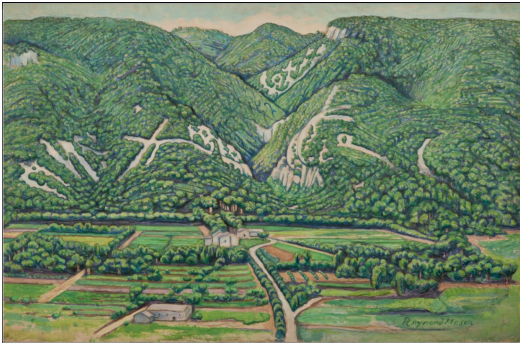
Raymond Mason Vue de Menerbes 1974 Epoxy resin and acrylic paint 29 1/4" X 43 3/8" The William Louis-Dreyfus Foundation Inc.